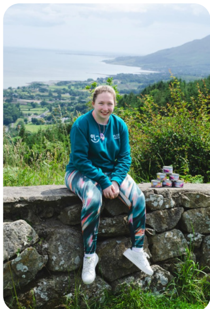
A difference to families, young people, seniors and everyone in our community.

Every single candle is handcrafted by our skilled candle-makers of mixed abilities, and we take great pride in every creation. It's more than a candle, it's a piece of home. Bring the springtime spirit indoors and celebrate the landscapes we love.