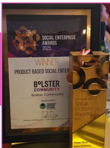
We are this year's winners of the Product Based Social Enterprise Award. Thank you to Social Enterprise Northern Ireland!

Meanwhile, our community programmes have continued to thrive. To name only a few, the Clover Club has been spreading friendship and laughter, the Social Kitchen has been serving up hearty meals and conversation; and Autism Connect has provided a vital space for understanding and connection. These are not just programmes. They are lifelines of belonging, and together they paint a powerful picture of what community truly means. At the heart of all we do lies our Family Support service, standing beside parents, carers and children through life's challenges and changes. Whether it's offering a listening ear, practical advice, or a helping hand in times of need, our team has been there – walking alongside families as they rebuild confidence, rediscover joy, and create stronger, more connected homes. In a world that can sometimes feel uncertain, this support reminds us that no one has to face their struggles alone. As the year draws to a close, we look ahead with gratitude and optimism. The world may feel vast and unpredictable at times, but our little well of hope here in Newry continues to flow – steady, strong, and full of promise. So here's to connection, to celebration, and to every one of you who makes this community shine. Please note that Bolster Community will be closed from Saturday 20th December and will reopen on Monday 5th January 2026. We look forward to welcoming you back in the new year!!