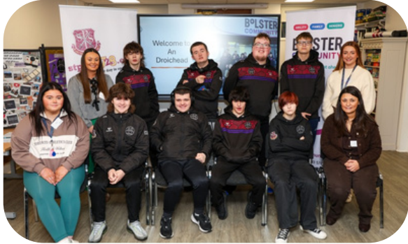
Students and staff of An Droichead. A very proud moment for all involved.

We were delighted to welcome Economy Minister Caoimhe Archibald MLA to our Marcus Street office to celebrate the achievements of the young people participating in our An Droichead programme. Funded through the Department for the Economy NI's Apprenticeship Inclusion Challenge Fund, An Droichead is a new full-time, dual-pathway initiative supporting young people aged 16+ with additional needs. Delivered in partnership with St Paul's Bessbrook, the programme provides recognised qualifications, work experience, employability and life skills, and a supported pathway into apprenticeships or employment. We extend our thanks to the Minister, parents, partners, employers, and – most importantly – the young people who shared their inspiring stories. Together, we are helping to build a more inclusive community where every young person can thrive.