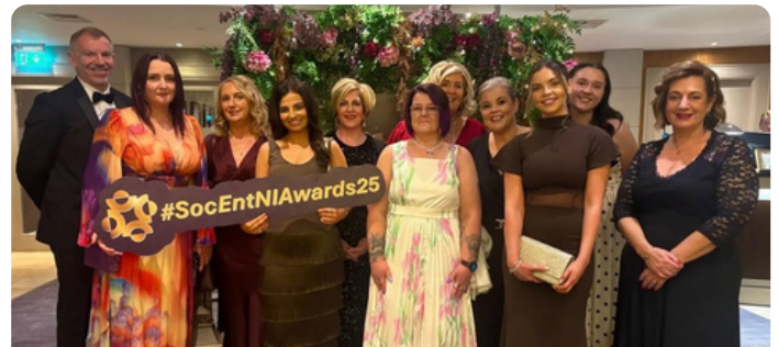
Some of our board & team at the SENI Awards 2025. Congratulations team!

This December, we're shining a light on the people and projects that make our corner of the world such a special place. Our Bolster Buddies have been hard at work in the candle shop, pouring care into every handmade piece, ready to bring a little extra warmth to homes near and far. We've loved seeing so many friendly faces at local Christmas fairs and markets, including our annual Sip & Shop, where festive joy is rivalled only by the generosity that inspires it.