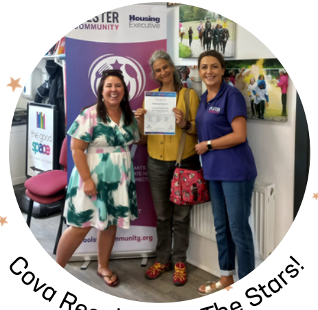
Cova Reaches For The Stars!