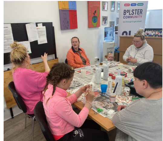
The Women's Group at Star Bites-57 having a chat & getting creative