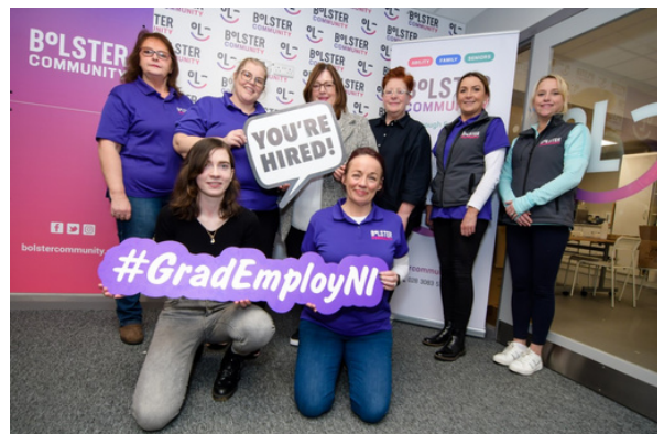
A few of the girls from Bolster Community Celebrate Partnership with International Charity Leonard Cheshire and Ulster University.